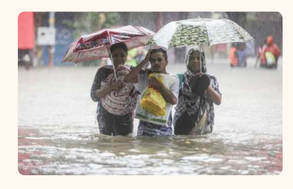
The Monsoon Rain

Interpret the flickering candle flame as a metaphor for hope and the light that drives away the darkness during times of despair.